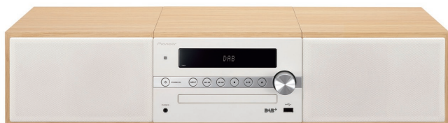
X-CM56D(W) Horizontal speaker setup