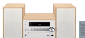
Vertical speaker setup