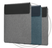
Lenovo Yoga Sleeve