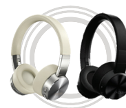
Lenovo Yoga Active Noise Cancellation Headphones