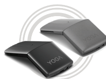
Lenovo Yoga Mouse with Laser Presenter