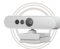
Lenovo 510 FHD Webcam