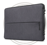
Lenovo Urban Sleeve Case